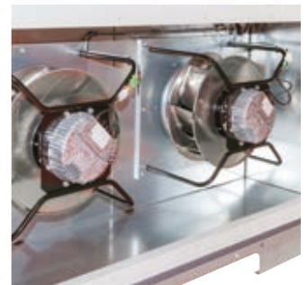
EC PLUG FANS