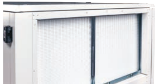
SUPPLY AND RETURN AIR FILTERS

Floway panels are thickly insulated to ensure complete acoustic comfort.